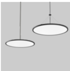
TASK round suspended