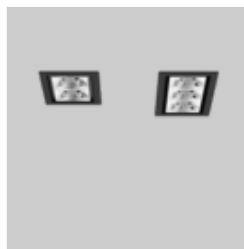
UNICO L2 / L3 basic recessed