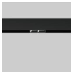
L2 MOVE IT 45