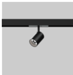
JUST 45 MOVE IT