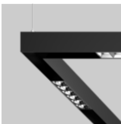
MOVE IT 45 surface / suspended system