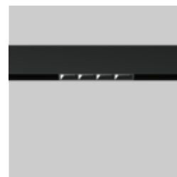
L4 MOVE IT 45